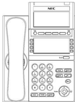
DESI Less 8 Button